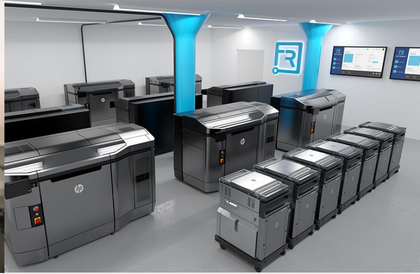
HP MJF Factory Chicago, IL