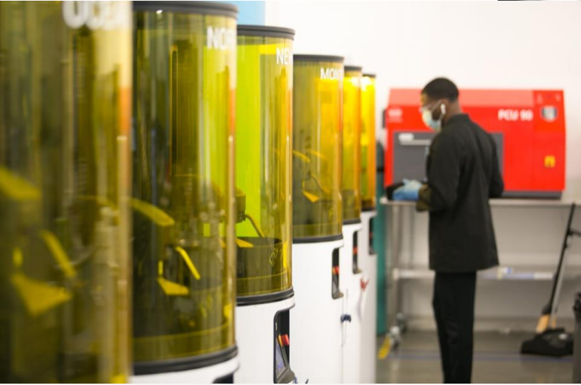
Carbon DLS Factory Chicago, IL