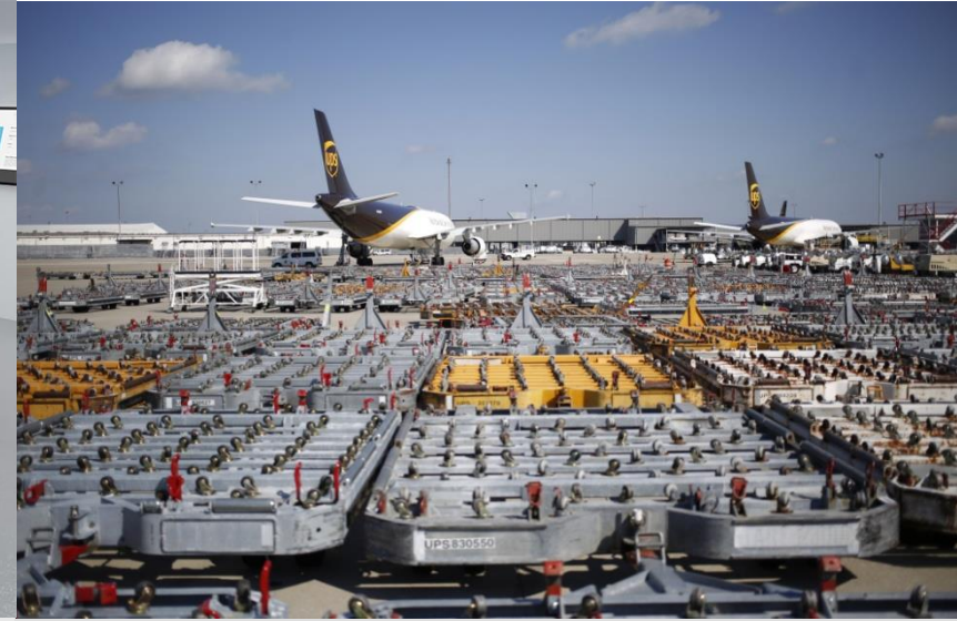
Stratasys FDM Factory Louisville, KY